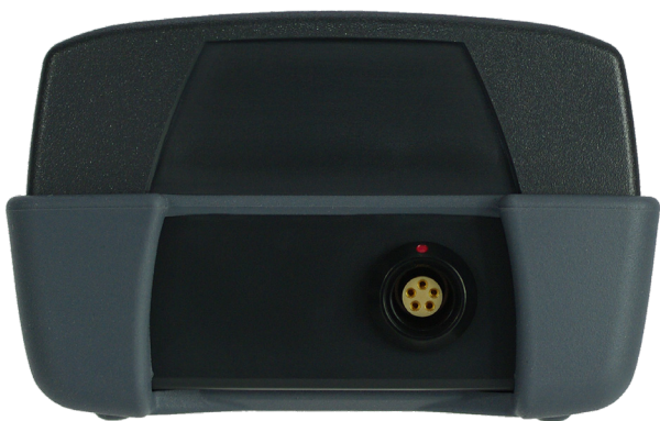
Front view, featuring the input connector for the accelerometer