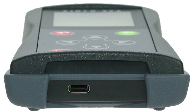
Rear view, equipped with a USB-C connector for data transfer and battery charging

Product of SWEDEN VMI INTERNATIONAL AB Gottorpsgatan 5 582 73 Linköping, Sweden